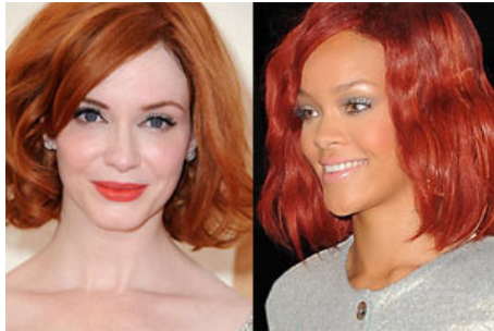
Our favourite redheads: Christina Hendricks and Rihanna